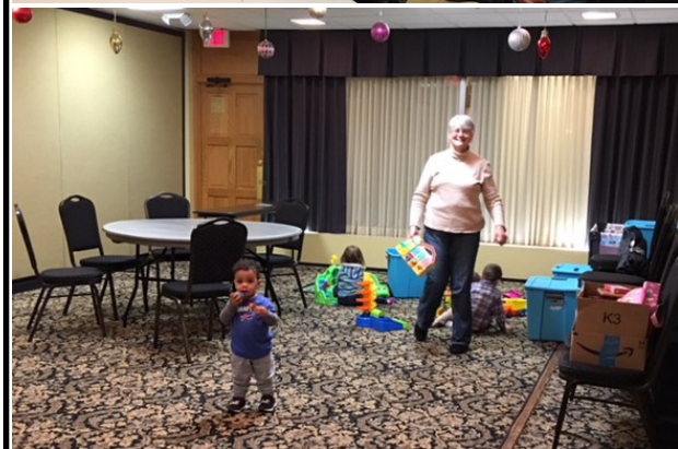
Our space will give us enough room for 150-200 people.

The space we'll be using is divided into 2 areas. On Sunday morning one is for worship and one is for our nursery/toddler area. On Sunday nights we had to figure out how to make our 2 spaces work for the nursery/toddler area, children's ministry, youth ministry, and adult small groups. We came up with a few innovative ideas—at least ideas that were new to us. Our Children's ministry and Nursery/Toddlers are going to share their space on Sunday nights. That means our youth and adult ministries are going to share the other space on Sunday nights. With the thoughts of possible distractions of having Children's, Youth, and Adult ministries all trying to do some musical worship and games at different times in the same spaces, we decided to have FAMILY WORSHIP and GAME TIME on Sunday nights. That's a new thing for all of us. Turns out EVERYONE likes to play youth group games (no, not all the crazy sweaty games we played in Rome!) as well as singing the kids songs. No, I won't share the video of our adults all trying to do the motions to the kids songs, but I will tell you that we all had a laugh and enjoyed the time we spent worshipping the Lord in this unusual manner. After the family worship and game time we'll all break apart into our age groups for an age-appropriate time of study. It's not something I would have thought of without the necessity of thinking outside of the box caused by our space restrictions, but it's something that I think we're all going to benefit from.