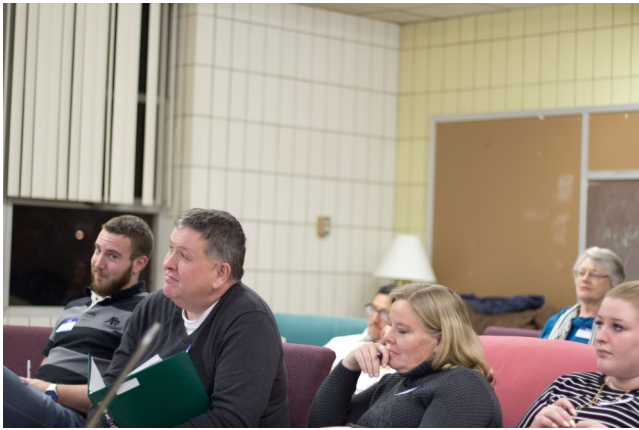
Part of our CORE leadership team on day #1.