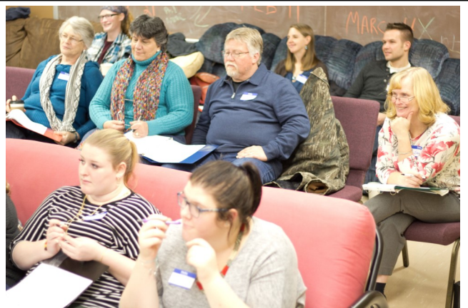
More of our CORE leadership team on day #1.

We believe that this is a good system to meet people where they are, introduce them to Christ, and help them grow into mature disciples who make more mature disciples. While there will be "room" for someone to be part of our church without "getting caught up in the flow of spiritual formation," most people will benefit from a design to intentionally help them make determined strides to become mature disciples of Jesus Christ who are actively involved in making more mature disciples of Jesus Christ.